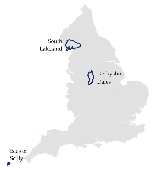
Figure 3. Local authority case studies in England.

Based on the CARTI results in Figure 2, three local authorities were selected as case studies with which the validity and usefulness of the CARTI could be explored at the local authority level. In Figure 3, the Derbyshire Dales, South Lakeland and Isles of Scilly were selected based on their contrasting CARTI scores, geographical distribution, and due to transport and CAEV-related projects and trials occurring in these local authorities at the time of the study. A national perspective on the CARTI's use was also sought in a workshop with the Department for Transport's (DfT) Chief Scientific Advisor. Online workshops with these transport and planning professionals within the case study areas were carried out to establish their perspectives on the CARTI and its potential application within their respective regions. These workshops were conducted in accordance with the Declaration of Helsinki [79] and approved by the University of Nottingham Faculty of Engineering Ethics Committee, the results of which are reported in the following section.