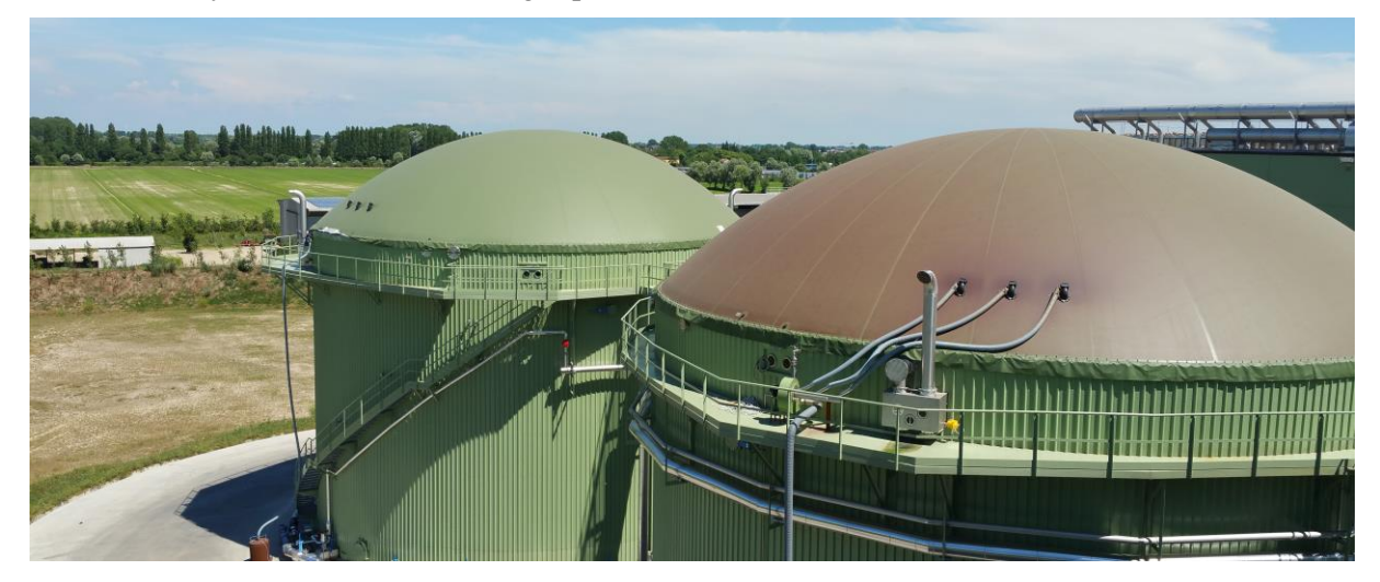
Figure 2: Typical double layer pneumatic roof for digesters. The change in the colour of the membrane roof it is clearly visible and it is related to the degradation of the membrane due to the aggressive chemical environment.

The digesters are generally based on a circular geometry realized in concrete or steel and covered with a double layer membrane roof supported by the internal pressure (pneumatic domes) or by a central pole (cones). The internal layer prevents the release of gas in the atmosphere and requires an exceptional resistance to the high concentrations of corrosive chemicals, the external layer protects the roof from the weather and the accidental loads (snow, wind, rain etc.). The solution is very effective and it is widely used in the current biogas plants.