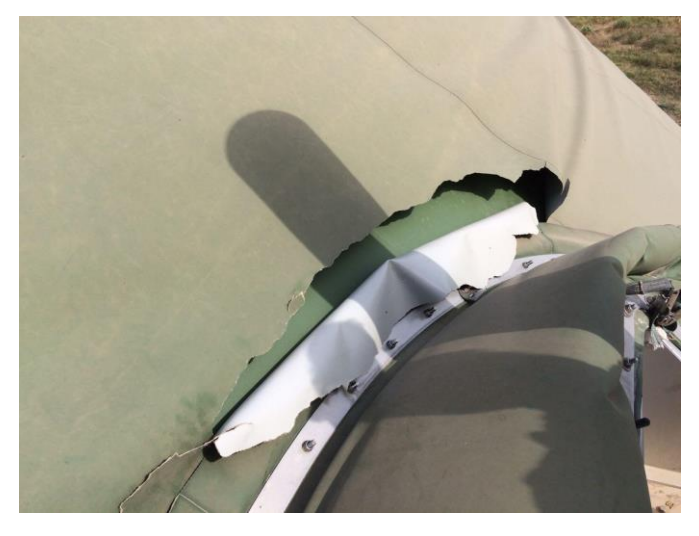
Figure 8: Damage in correspondence of a rigid boundary due to the strong wind and the progressive decrease of the mechanical performance of the coated fabric.

Membranes structures are appreciated in biogas applications thanks to their light weight and high strength combined with the flexibility and elasticity of coated fabrics. However, the light weight of fabric structures makes them prone to wind load and may result in fluttering. In extreme circumstances, this fluttering may induce unexpectedly high tension forces in the fabric and in correspondence of the connection points. Figure 8 show a typical damage caused by the movement of the membrane in correspondence of the rigid boundaries. The effect of the wind, combined with the effect of the early degradation of the fabric, results in damages which are generally unusual for architectural membrane structures with the same age.