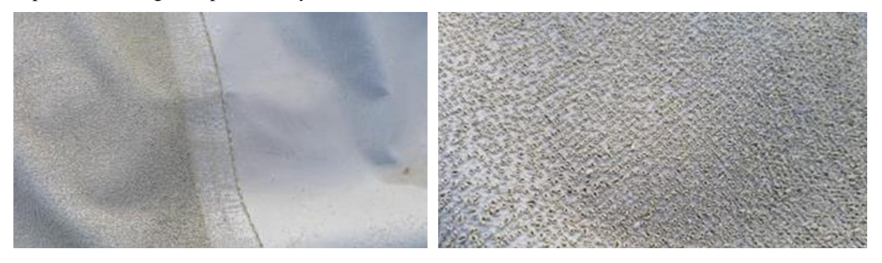
Figure 6: Degradation of a PVC coated polyester fabric due to the exposure to the chemicals of a biogas plant.

The degradation of the fabric due to corrosion is confirmed by mechanical tests on a similar case study of a 5 years old digester where the breaking load of the fabric decreased by 72-80% from to the expected breaking load provided by the datasheet