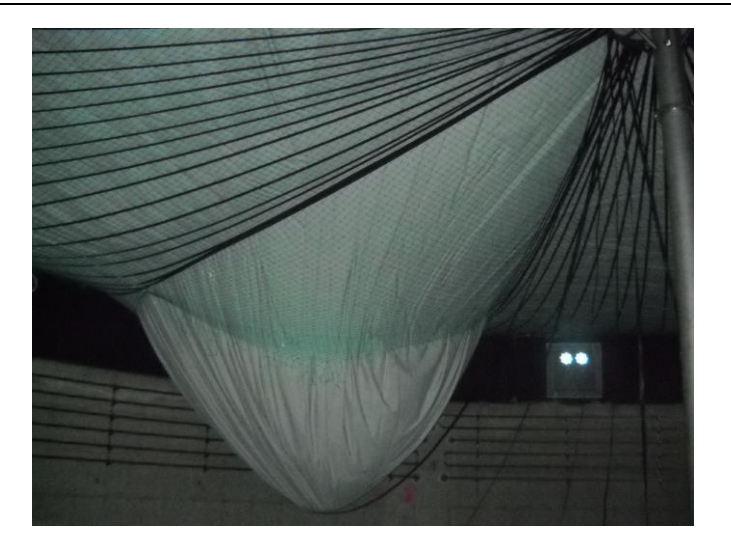
Figure 9: Failure due to snow load.