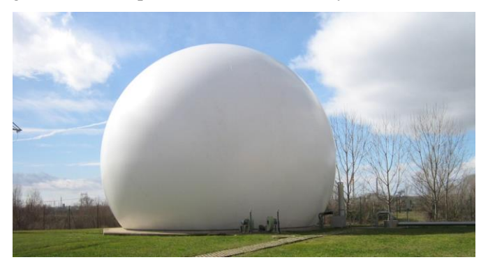
Figure 5: Example of a double-membrane gasholders [6]

the gas produced. The structures of a membrane tank is generally based on a double membrane system with an external membrane for weather protection, an internal airtight membrane to store the gas and a bottom membrane designed to enclose the gas space. At this stage, the gas is generally less corrosive than the mix of chemical produced in the digesters, however, for safety reason it is crucial that the gasholder is completely airtight and in good conditions during the entire service life. I small damage could cause the loss of gas with consequences in terms of safety and economic losses.