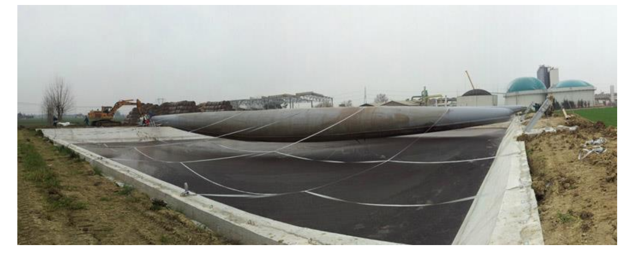
Figure 3: Rectangular lagoon covered with a pneumatic beam [5] derived from the Tensairity<sup>®</sup> concept with a total span of 45m.

Lagoons and storage tanks are large structures designed to store the sewage after it has been treated, they could be circular, elliptical or rectangular. Unlike the digesters they are generally covered by a single layer with lower performances due to the reduced temperatures and concentrations of corrosive chemicals. The membrane roof protects the tank form the rain water and prevent the release of gas (which in some cases is aspirated and used to produce energy) usually quite intense to the olfactory senses. The gas released by the sewage can contribute up to 10-15% of the total production of gas, for this reason in recent years large industrial plants started to demand membrane roofs able to maintain a cavity between the liquid and the membrane where the gas can be accumulated and extracted. The structures represented in figure 3 and figure 4 are pilot projects designed to address this requirement and offer a effective solution to the problems related to the drainage of the rain water.