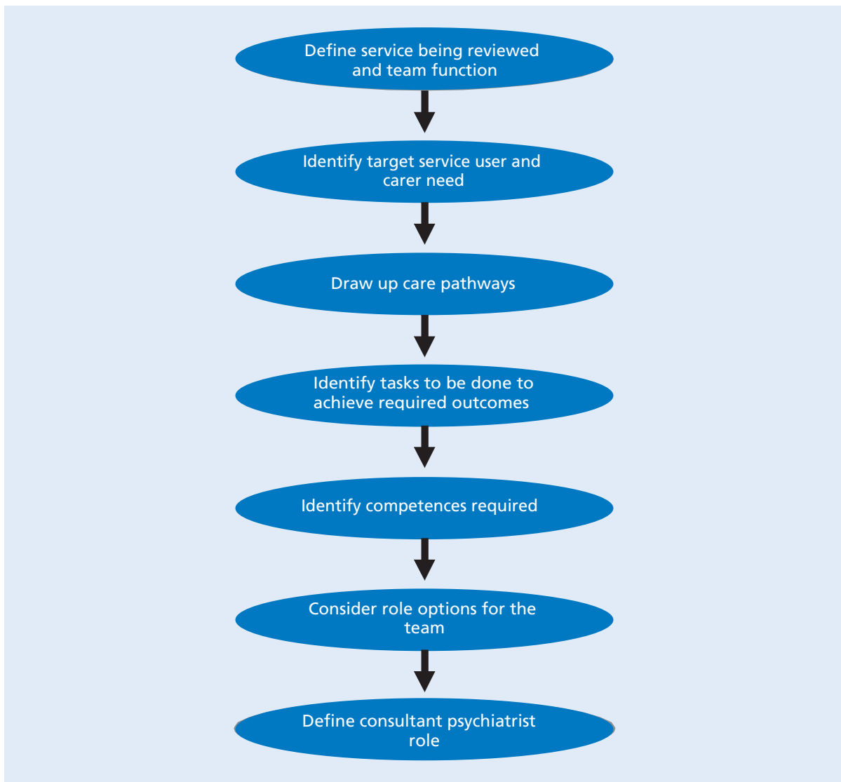
Figure 1 Analysing service demand and the consultant role