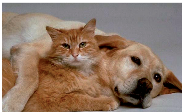
Fig. 1. Conflict of interest is a condition, not necessarily a behaviour. Dogs generally chase cats, but there are plenty of examples of them living together harmoniously.

Two important points emerge from this definition. The first is that COI is a condition and not necessarily a behaviour. It may be said for instance, that dogs generally chase cats, yet there are plenty of examples of the two living together in harmony (Fig. 1). Merely being a dog does not necessarily mean that a type of behaviour (chasing cats) has occurred – it simply means that on average a dog will chase ( behaviour ) a cat because of the condition of "being a dog". In other words, COI is a set of circumstances, interests or conditions that place the affected person in a position of potentially being influenced by those circumstances. It does not