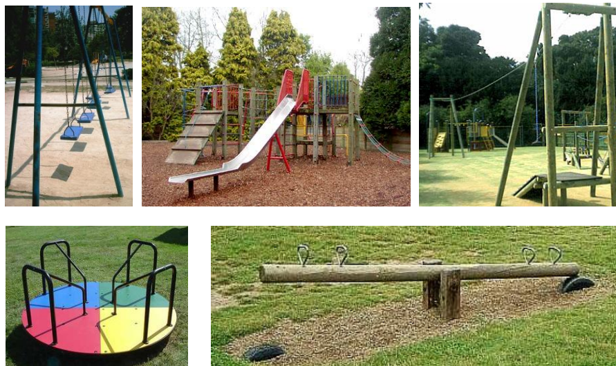
Figure 1 Play equipment commonly found in UK playgrounds. (Clockwise from top left) Swings, slide, zip-wire, roundabout, see-saw.

Given the authors previous work on playful technologies which sensed the responses of participants (see section 1), this session began with a talk by an expert, who described a broad range of available sensing technologies, and motivated their use. Participants were then reformed into different groups, and each was given a single type of ride to work on. Participants were then asked to design a novel ride which was inspired by this, but which integrated electronic sensing technologies in some form. For this activity, participants were explicitly told that they could think beyond the boundaries of the playground, and were provided with a selection of materials to construct models of their designs from. As before, group presentations were video-recorded, and photographs of all models constructed by participants were taken. Participants were then given the opportunity to talk about any thoughts that they had in relation to the workshop, which concluded after this session.