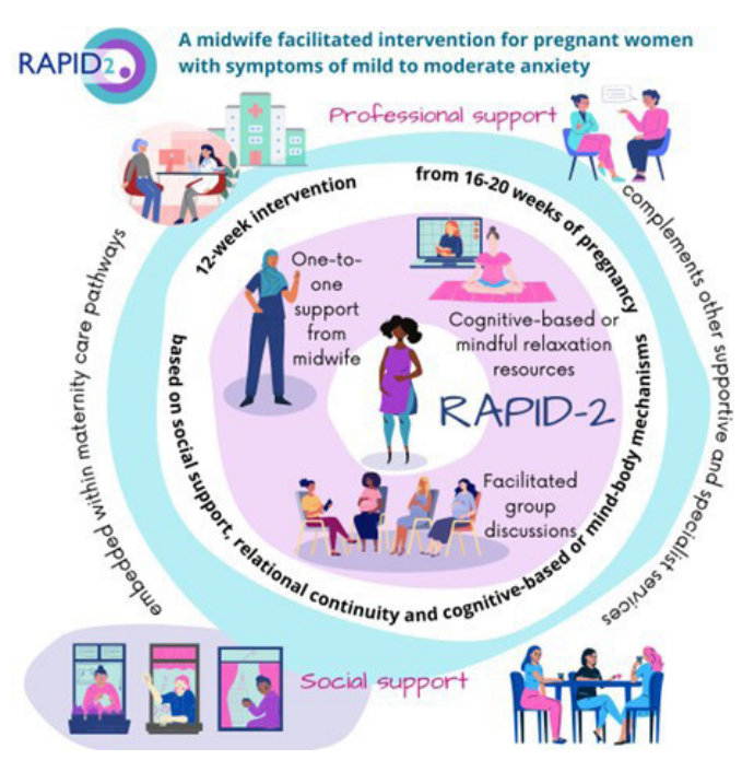
Components of the RAPID intervention.

Due to the COVID-19 pandemic, it was imperative to identify innovative ways to deliver safe, effective and equitable care. A systematic review was undertaken to identify and evaluate remotely delivered, digital or online interventions to support women with symptoms of anxiety