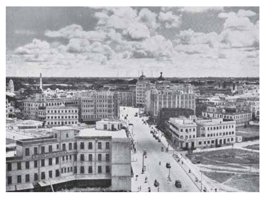
Figure 5.2 Contrasting urban forms in colonial India.