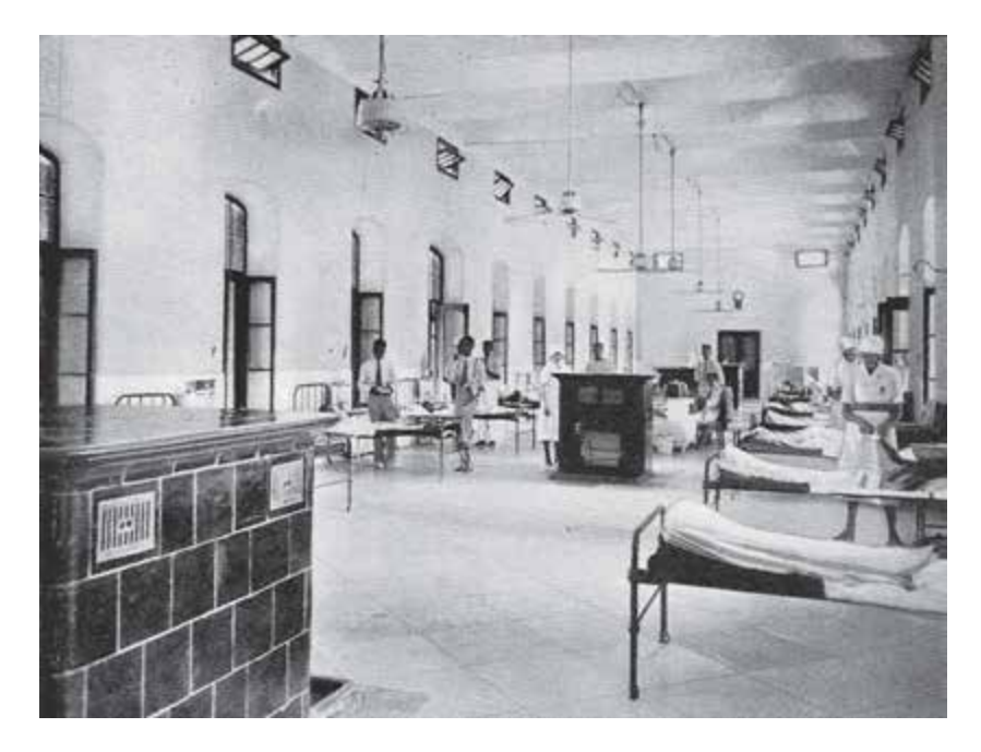
Figure 5.1 Spaces of medical modernity in colonial India.