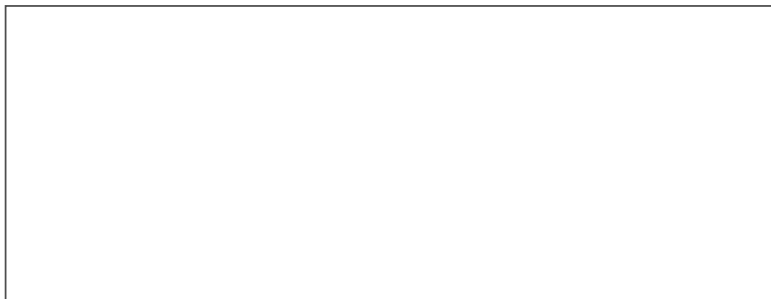
Figure 4: Concordances of 'scien*' in the context of 'so-called'

The strategy of creating associations between scientists and 'corrupt' politicians is not surprising in the context of the Daily Mail and its long history of exposing political scandals, dating back to eighteenth century campaign against 'Old Corruption' (Hollis 1970). Conboy (2008), for example, notes that in UK tabloids politicians are represented almost exclusively as involved in a game of duping the public, while implying that the tabloids themselves are doing their best to rectify the situation. As our comparative analysis of keywords has shown, associations between science and fraud, and scientists and politicians, were present in earlier comments before 'climategate', and were also observed in other studies of social media (Nerlich and Koteyko 2009). However, the topics and discursive strategies employed by tabloid readers in the 2010 corpus indicate that the East Anglia controversy might have allowed the commentators to become more assured in their assertions about this link; and to speak as if they now had proof for their views that the science of climate change was indeed 'just a money-making scam'. In other words, the controversy became a rhetorical stepping stone that allowed those tabloid readers who are opposed to the idea of man-made global warming to launch more provocatively phrased comments on the issue.